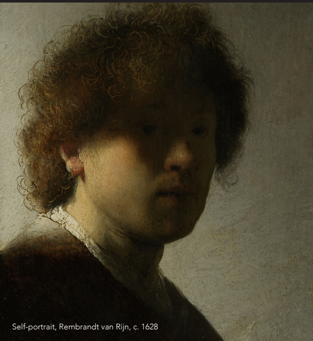
Self-portrait, Rembrandt van Rijn, c. 1628