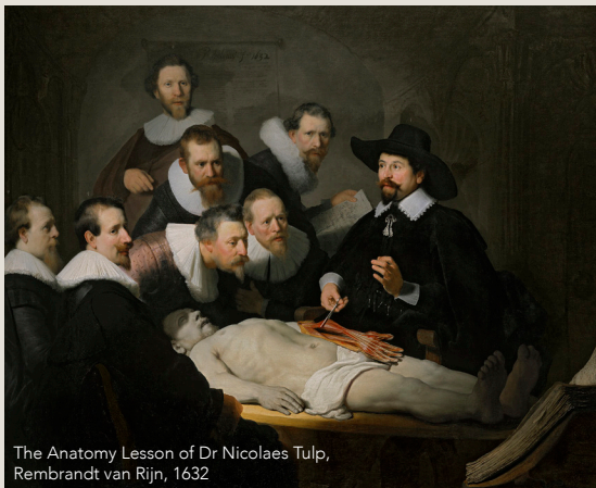
The Anatomy Lesson of Dr Nicolaes Tulp, Rembrandt van Rijn, 1632

The Mauritshuis presents the first retrospective exhibition of Nicolaes Maes, one of Rembrandt's most talented pupils. Featuring over 30 paintings, the exhibition shows Maes' varied oeuvre, from the biblical representations he painted at the start of his career through his intimate domestic scenes of subsequent years to his elegant style of portraiture from the 1660s onwards.