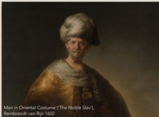
Man in Oriental Costume ('The Noble Slav'), Rembrandt van Rijn 1632

Almost 400 years after their creation, works produced in Leiden by the now internationally famous Master return to the city of his birth. With approximately 40 paintings, 120 etchings and 20 drawings on show, visitors can see how the young painter's talent developed and flourished.