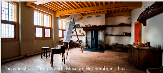
The workshop of Rembrandt, Museum Het Rembrandthuis

This exhibition focuses on Rembrandt's friends and acquaintances, and the role they played in his life and work. The informality of the paintings, drawings and prints is striking, and the exhibition includes work by Rembrandt that has rarely, if ever, been seen in the Netherlands.